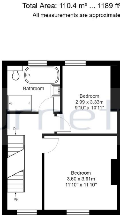
First Floor Area: 38.3 m 2 ... 412 ft 2