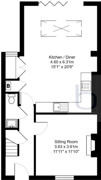
Ground Floor Area: 51.2 m 2 ... 552 ft 2