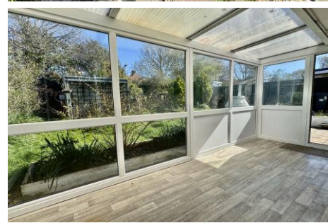
Want more photos and a video? Scan here