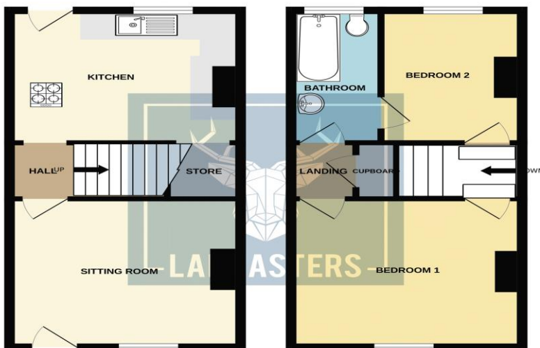
TOTAL FLOOR AREA: 671 sq.ft. (62.3 sq.m.) approx.

While every attempt has been made to ensure the accuracy of the description contained here, measurements of doors, windows, rooms and fittings are approximate and no responsibility is taken for any error, omission or mis-statement. This plan is for illustrative purposes only and should be used as such by any prospective purchaser. The services, systems and appliances shown have not been tested and no guarantee as to their operation or efficiency can be given.