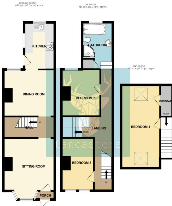
GROUND FLOOR 438 sq.ft. (40.7 sq.m.) approx.