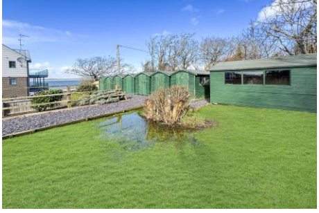
Want more photos and a video? Scan here

Lancasters Estate Agents 65 High Street | Cowes | Isle of Wight | PO31 7RL 01983 209020 Homes@Lancasters.org