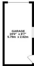
GROUND FLOOR 815 sq.ft. (75.5 sq.m.) approx.

No. 7 Stradling Close enjoys a particularly advantageous position, being located at the end of the Close with a direct open view to the playing fields behind. The front garden has been opened up to provide a gravelled parking area and adjacent single garage with single up and over door, plumbed sink and base covered plumbing for washing machine. A wide side path extends to the rear garden which is lawned and gravelled, enclosed by timber fencing with fine views across a large open green space.