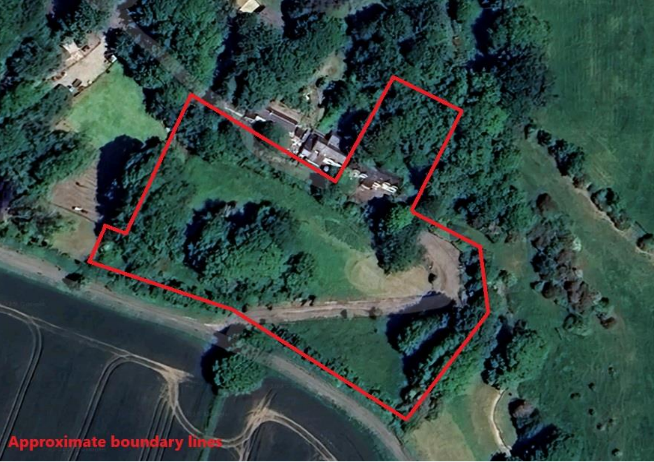
Approximate boundary lines