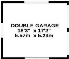
TOTAL FLOOR AREA : 1858 sq.ft. (172.6 sq.m.) approx.

Whilst every attempt has been made to ensure the accuracy of the floorplan contained here, measurements of doors, windows, rooms and any other items are approximate and no responsibility is taken for any error, omission or mis-statement. This plan is for illustrative purposes only and should be used as such by any prospective purchaser. The services, systems and appliances shown have not been tested and no guarantee as to their operability or efficiency can be given. Made with Metropix ©2022