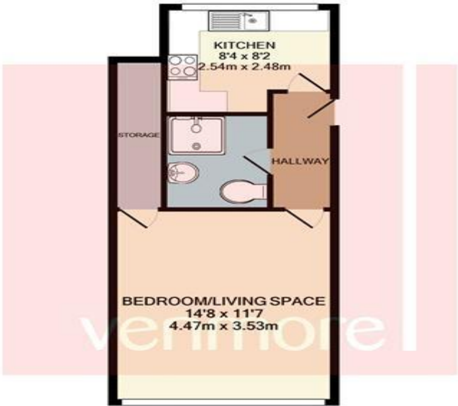
Measurements are approximate. Not to scale. Illustrative purposes only Made with Metropix ©2021