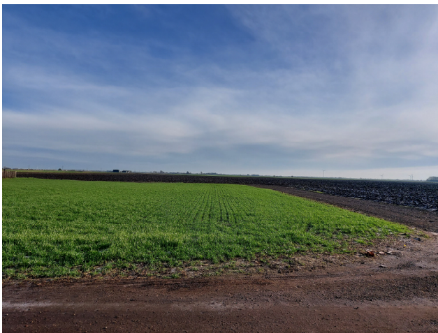
View of Plot 2 from Access Track