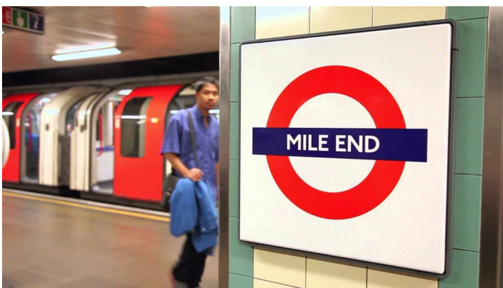
MILE END TUBE STATION