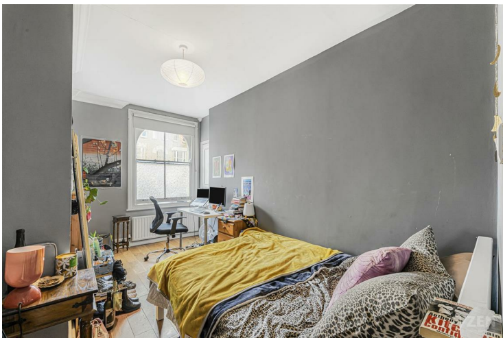
RECEPTION / BEDROOM