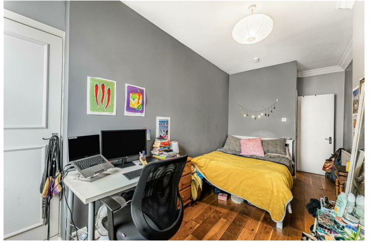
RECEPTION / BEDROOM