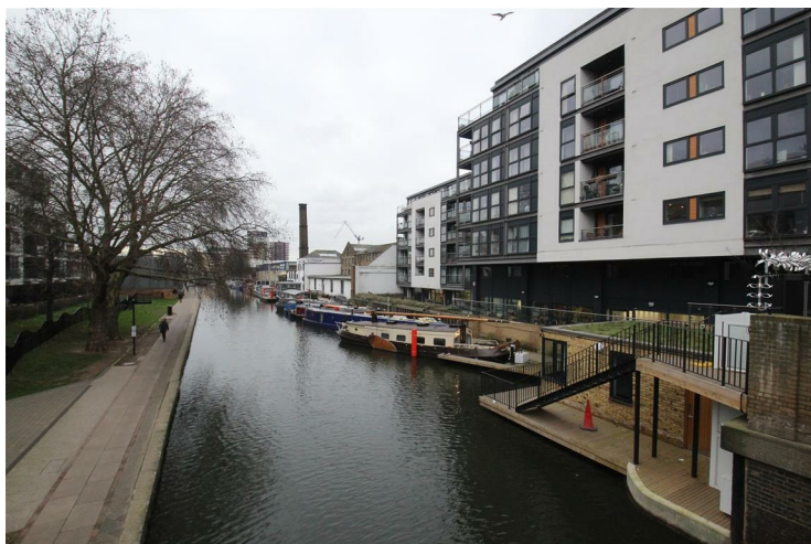
REGENT CANAL VIEW