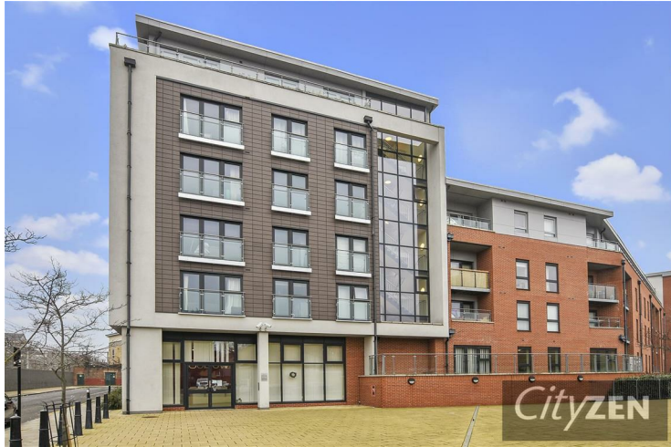
SO BOW DEVELOPMENT