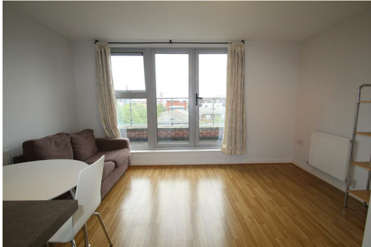
LIVING SPACE VIEW