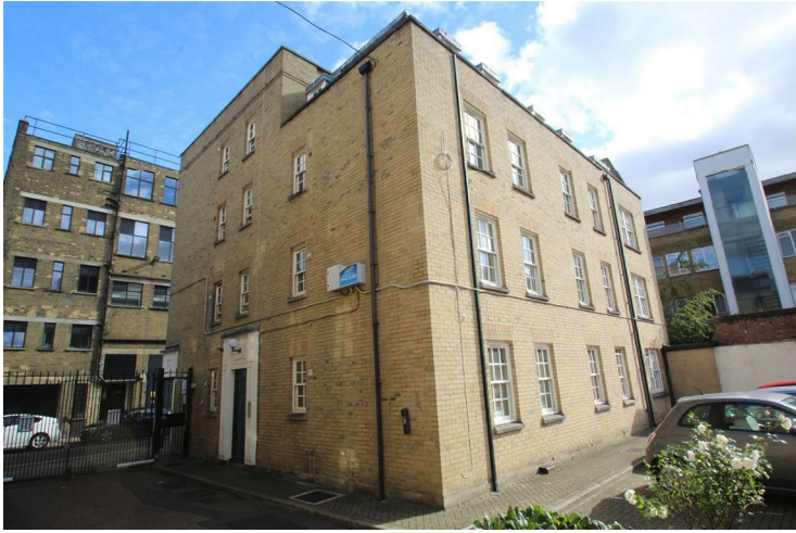
CROMWELL LODGE BUILDING