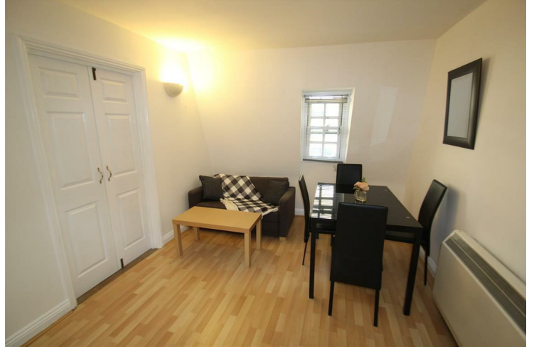
RECEPTION ROOM VIEW