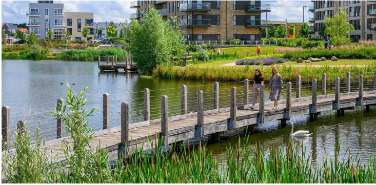
GREEN PARK VILLAGE