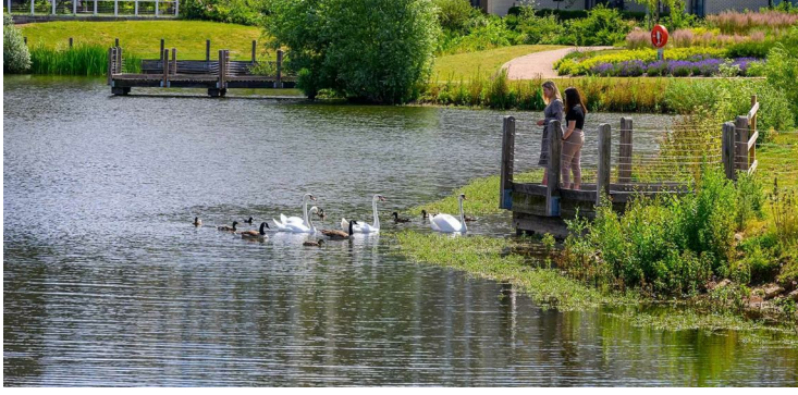
GREEN PARK VILLAGE