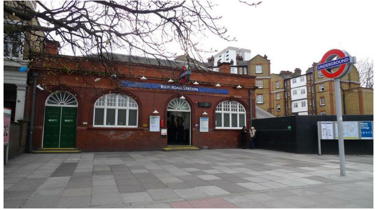
BOW ROAD STATION