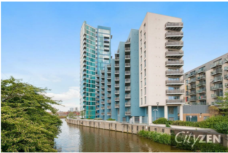
ONE STRATFORD BUILDING