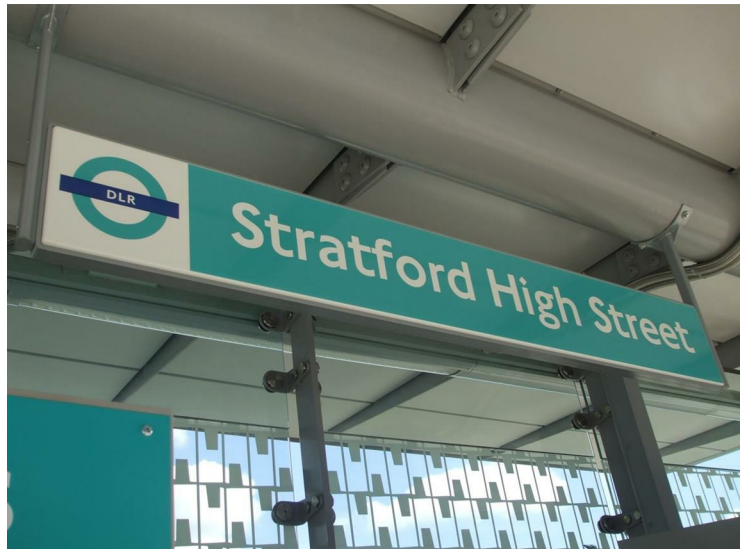
STRATFORD HIGH STREET DLR