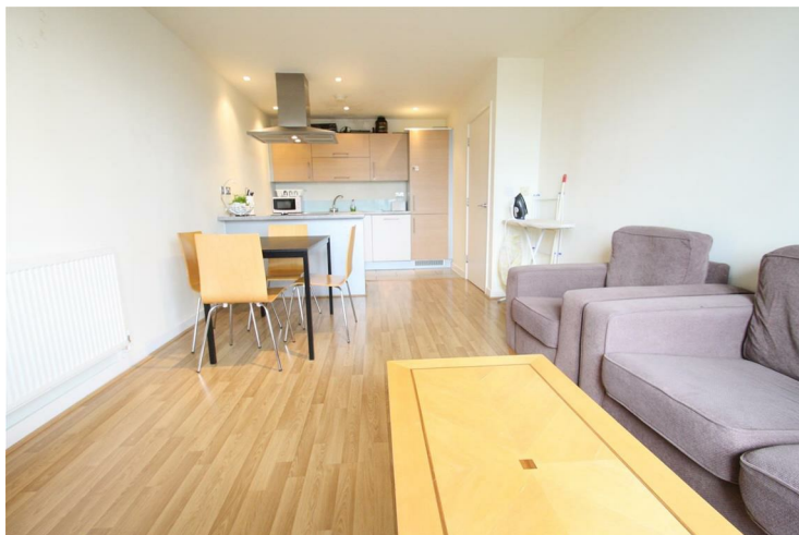
LIVING SPACE VIEW