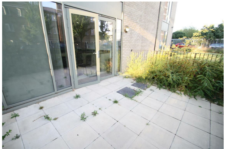
COURT YARD GARDEN