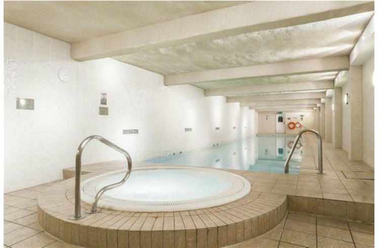
RESIDENTS POOL & SPA