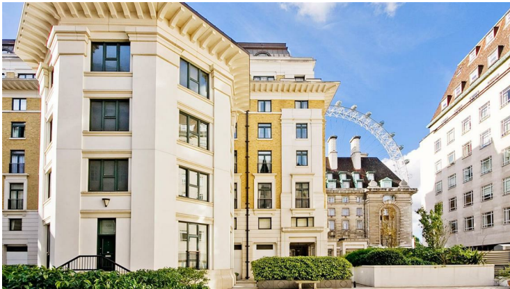
COUNTY HALL APARTMENTS