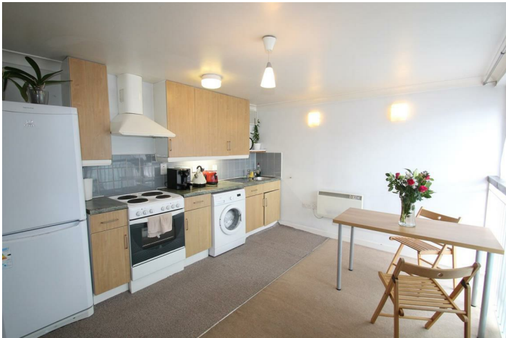
KITCHEN / LIVING SPACE