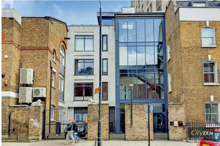
FRONT OF DEVELOPMENT