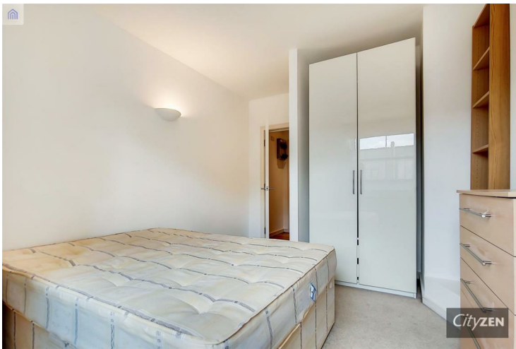
BEDROOM 2 VIEW