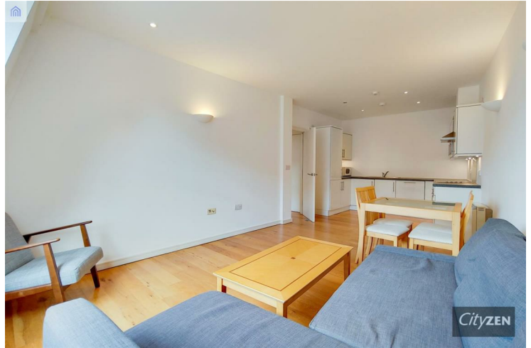
RECEPTION ROOM VIEW