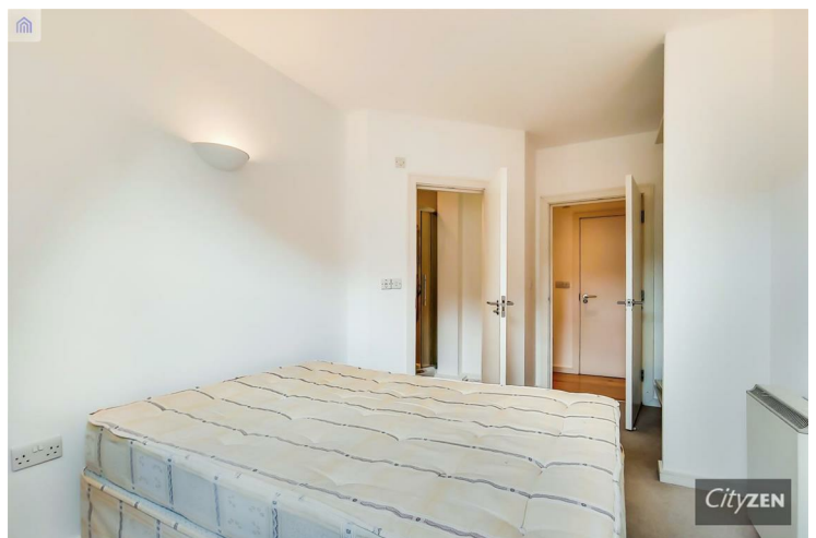
BEDROOM 1 VIEW