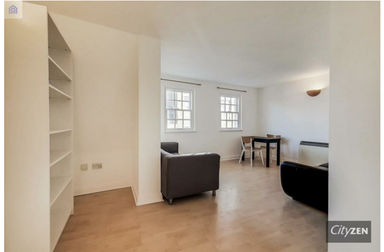
RECEPTION ROOM VIEW