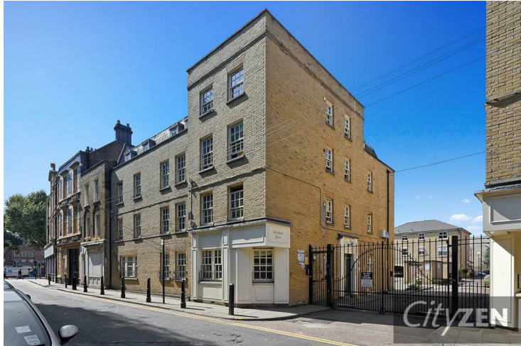
CLEVELAND GROVE ENTRANCE