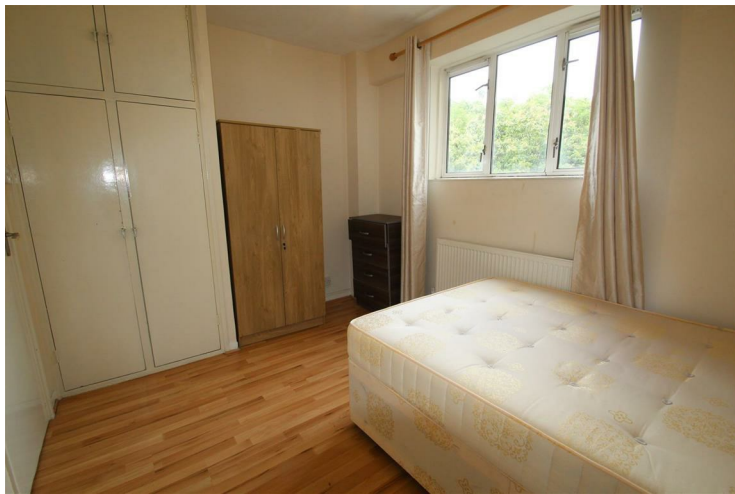
BEDROOM TWO VIEW