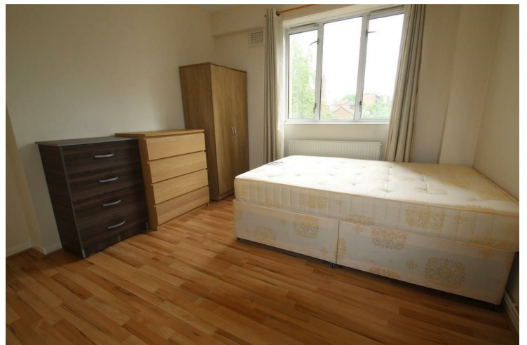
BEDROOM ONE VIEW