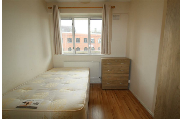
BEDROOM THREE VIEW