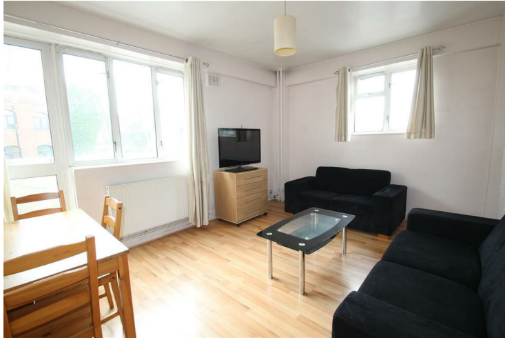
LIVING SPACE VIEW