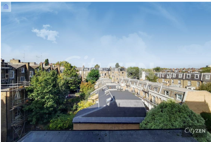
VIEW FROM BEDROOMS