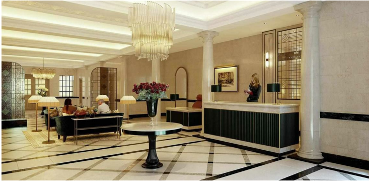
CONCIERGE 24 HOURS