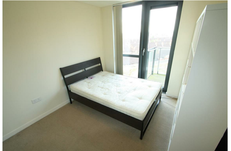
BEDROOM SPACE VIEW