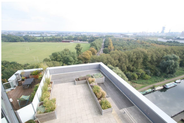
COMMUNAL TERRACE VIEW