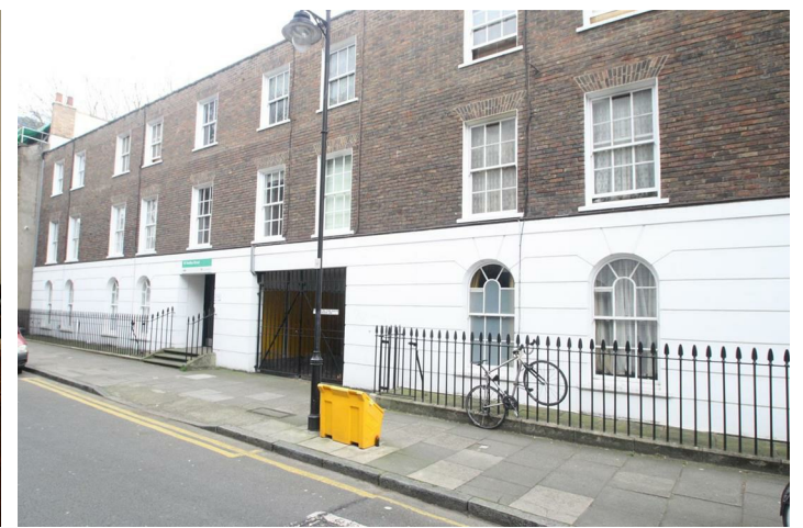
FRONT OF BLOCK