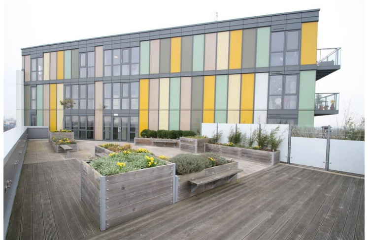
COMMUNAL TERRACE VIEW