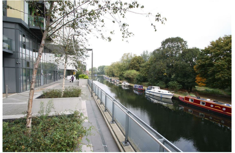
GROUND FLOOR CANAL VIEWS