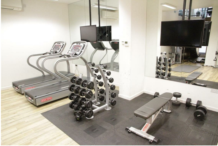
GROUND FLOOR GYM