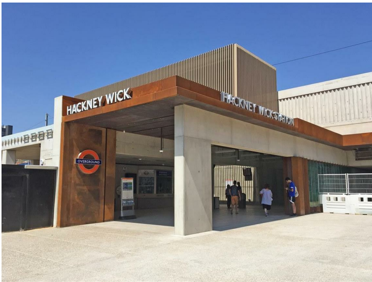
HACKNEY WICK OVERGROUND