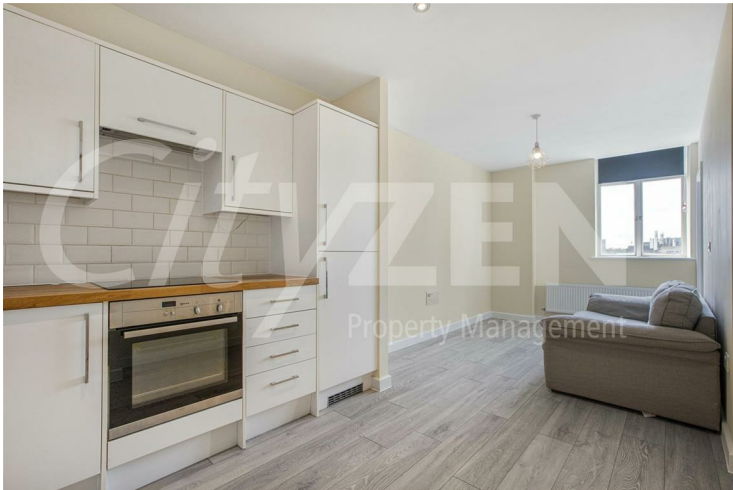
RECEPTION ROOM / KITCHEN