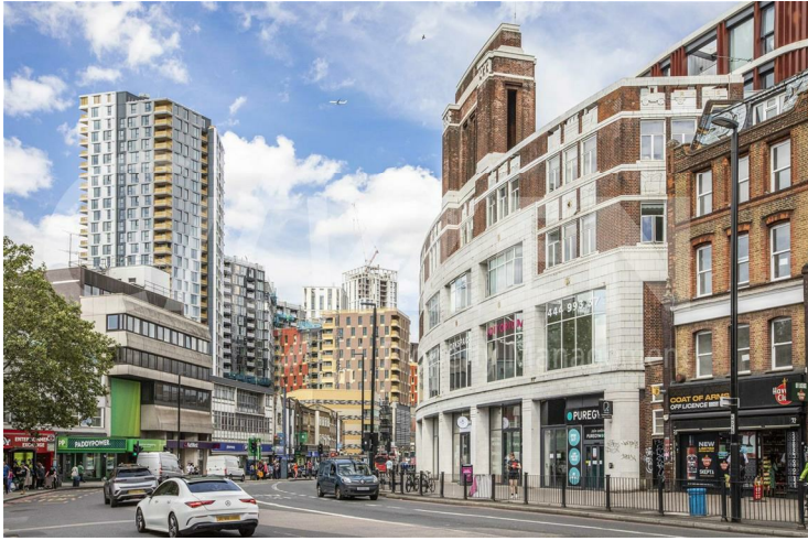
LEWISHAM HIGH STREET