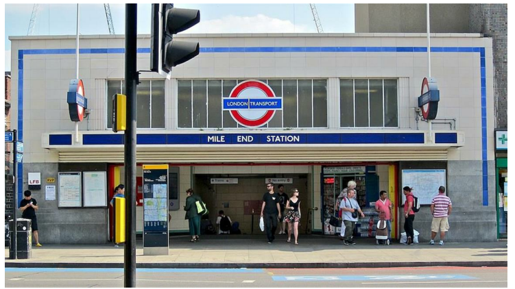
MILE END STATION