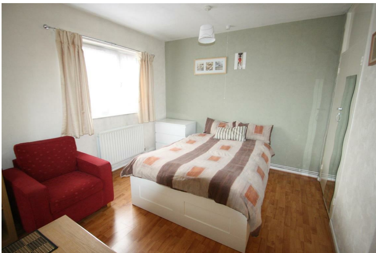
STUDIO ROOM VIEW