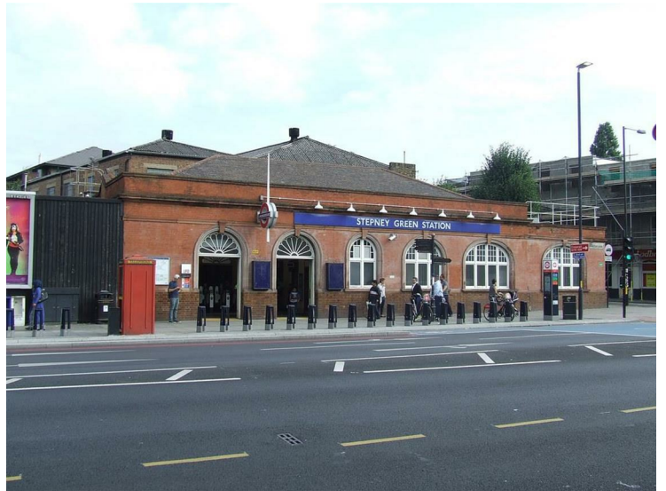
STEPNEY GREEN STATION