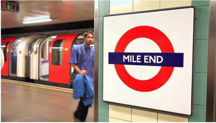
MILE END STATION