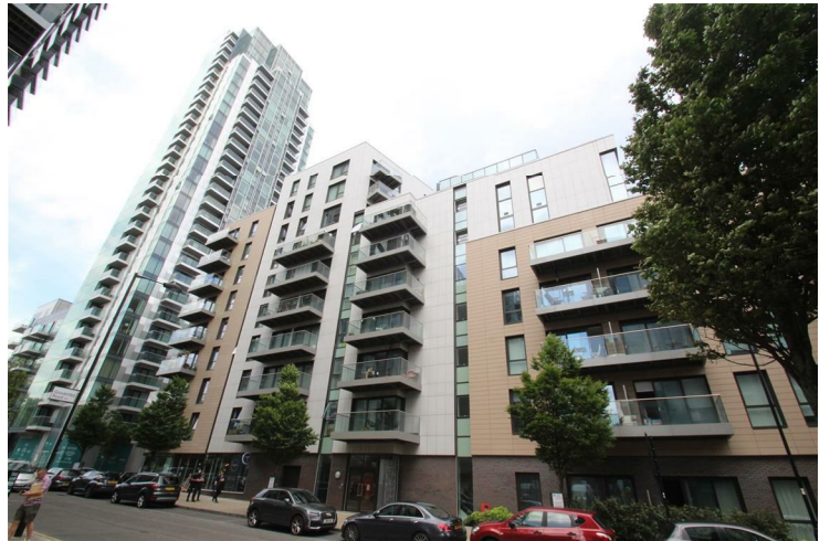
NATURE VIEW APARTMENTS