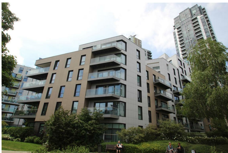
NATURE VIEW APARTMENTS