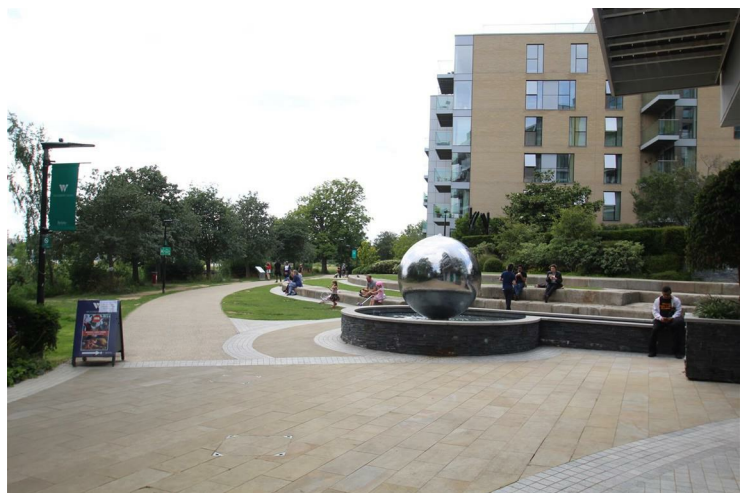
CANAL SIDE & PROMENADE