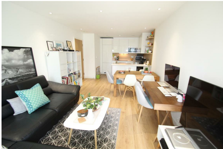
RECEPTION ROOM VIEW 2