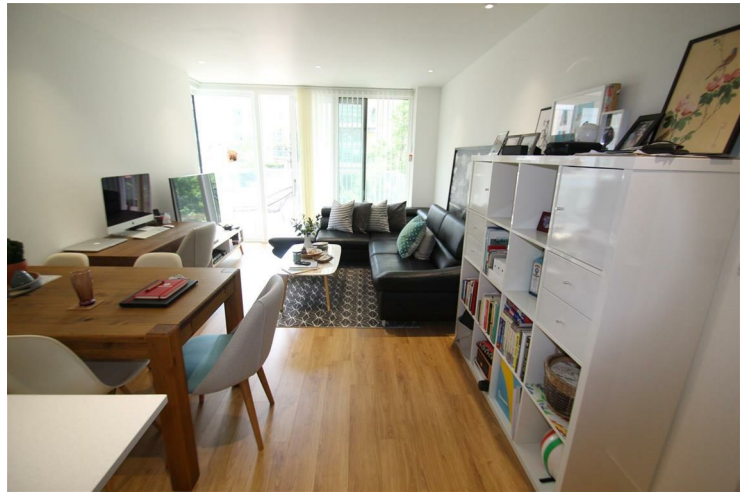
RECEPTION ROOM VIEW 1