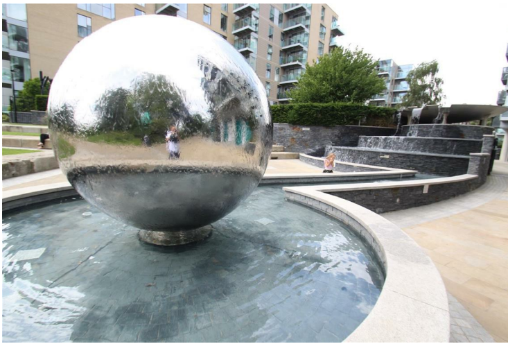
WATER FOUNTAIN AT PROPENADE