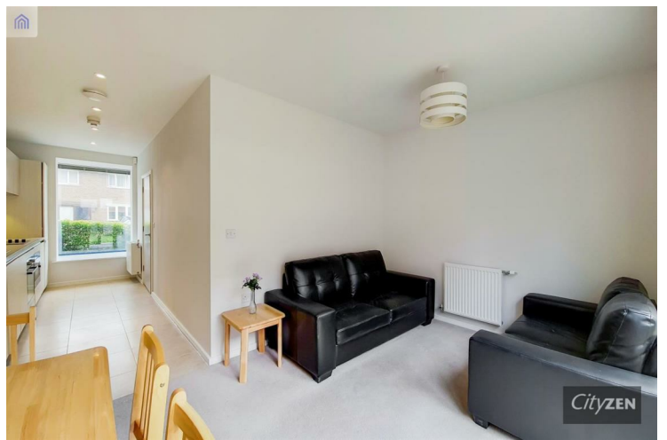
RECEPTION ROOM VIEW