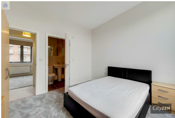
BEDROOM 1 VIEW