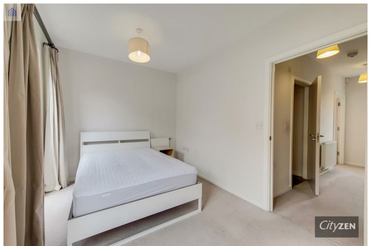
BEDROOM 2 VIEW