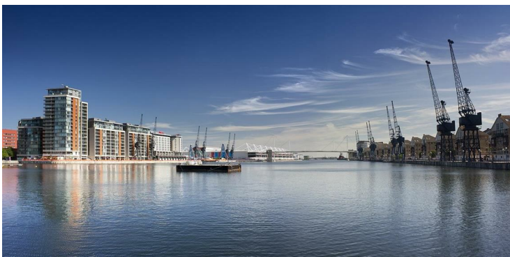
ROYAL VICTORIA DOCKS