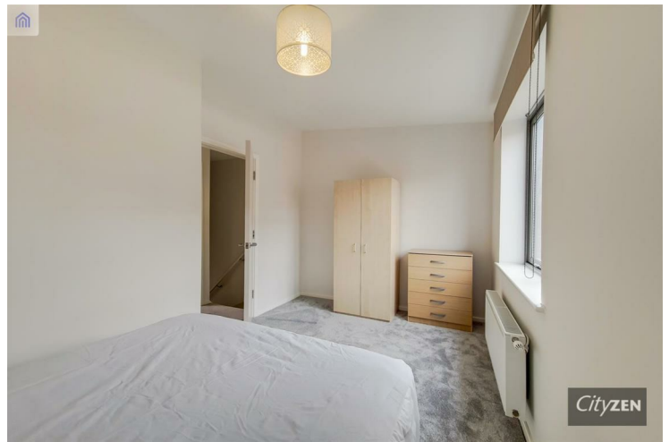
BEDROOM 3 VIEW