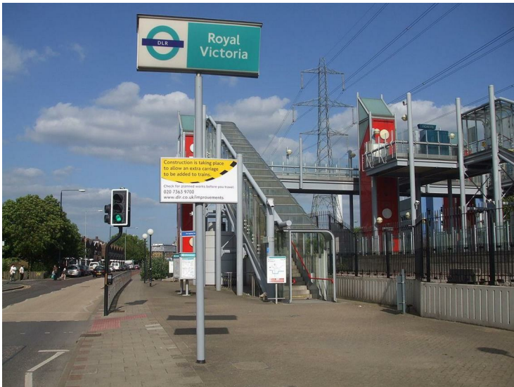
ROYAL VICTORIA DLR