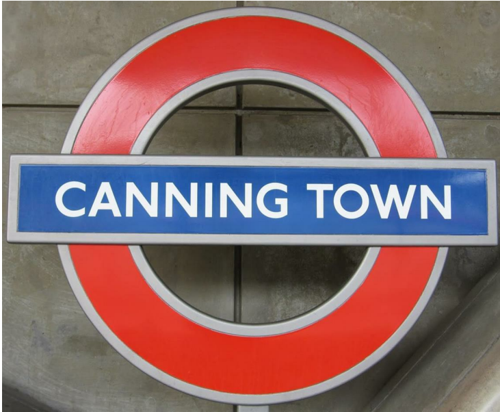
CANNING TOWN STATION