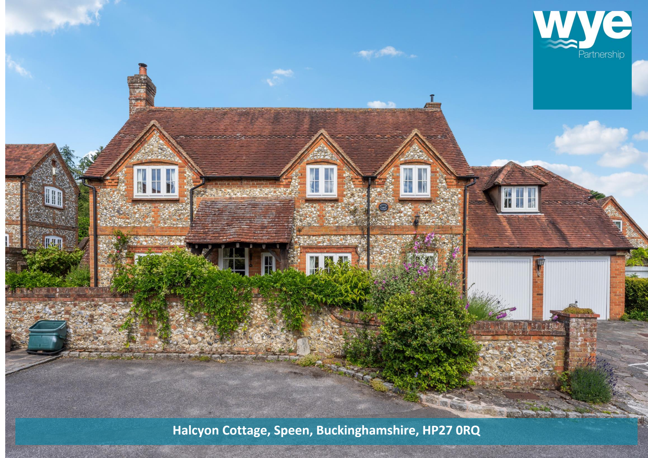
Halcyon Cottage, Speen, Buckinghamshire, HP27 0RQ