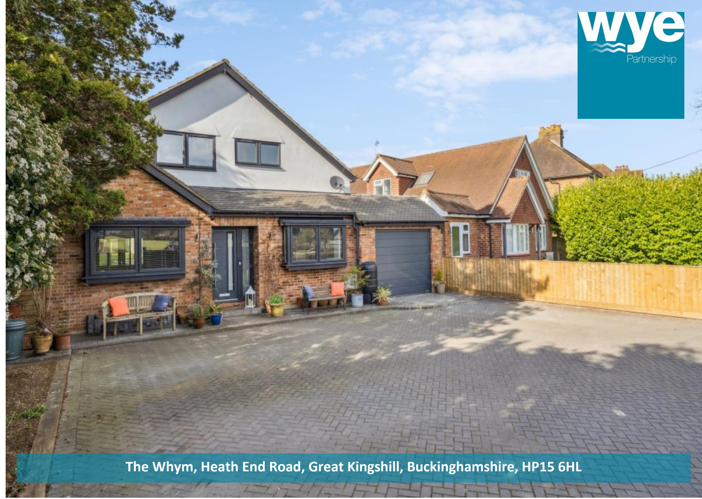
The Whym, Heath End Road, Great Kingshill, Buckinghamshire, HP15 6HL