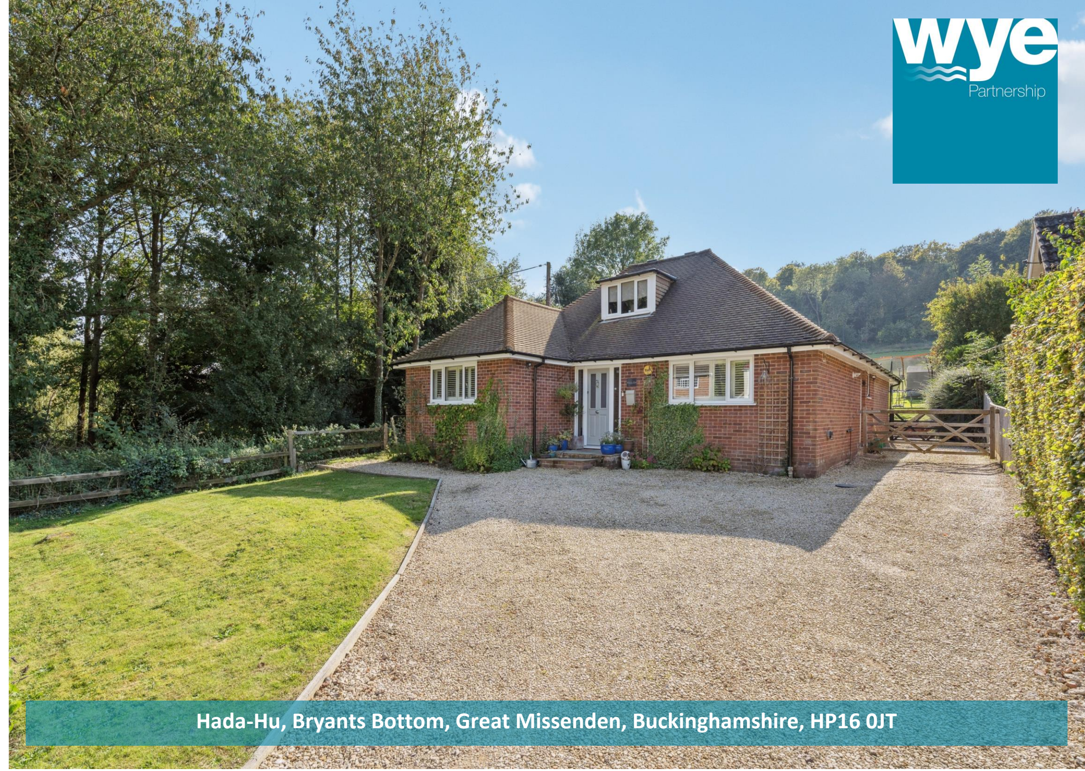
Hada-Hu, Bryants Bottom, Great Missenden, Buckinghamshire, HP16 0JT