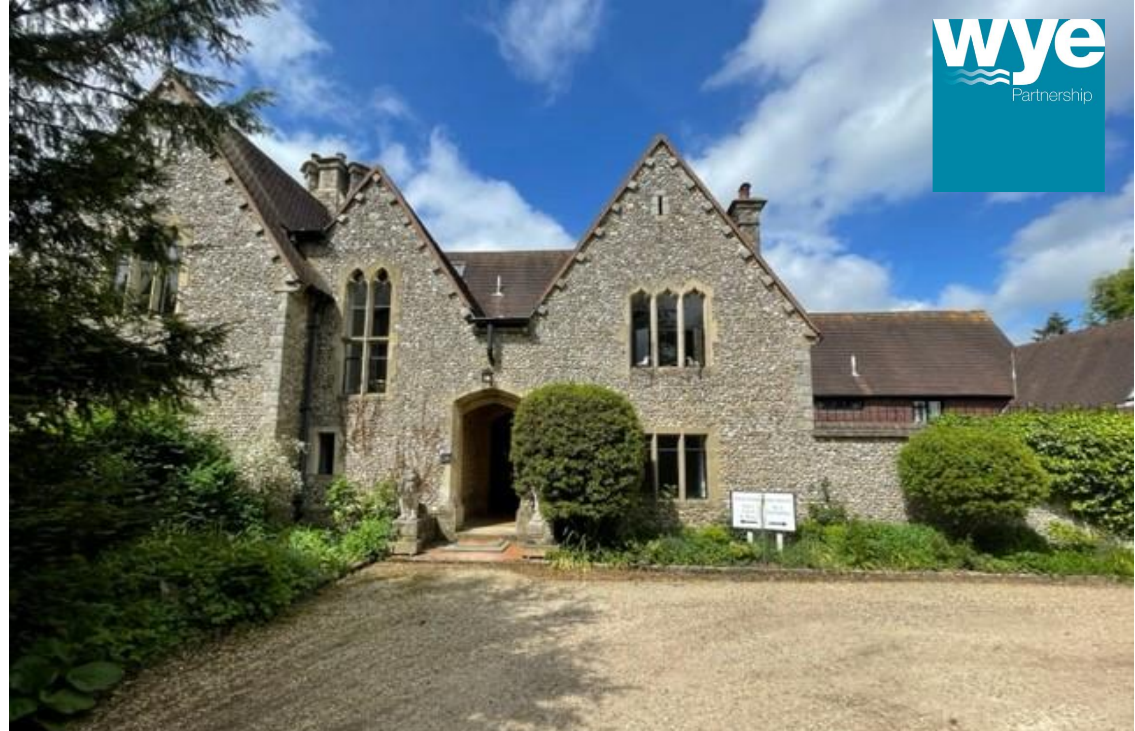
4 Prestwood Park House, Wycombe Road, Prestwood, Buckinghamshire, HP16 0HJ