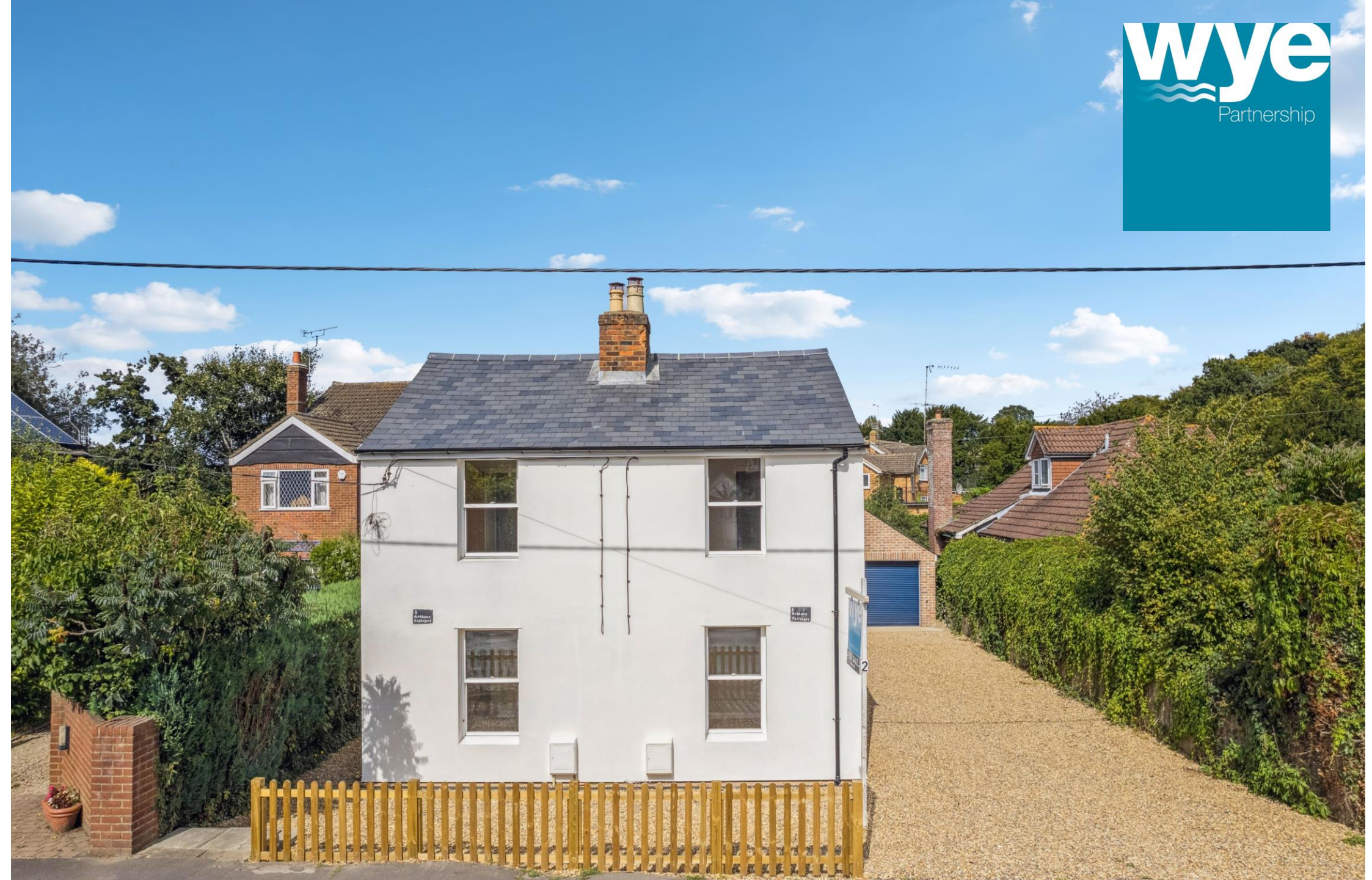
1, Arthur's Cottages, Stag Lane, Great Kingshill, Buckinghamshire, HP15 6EW