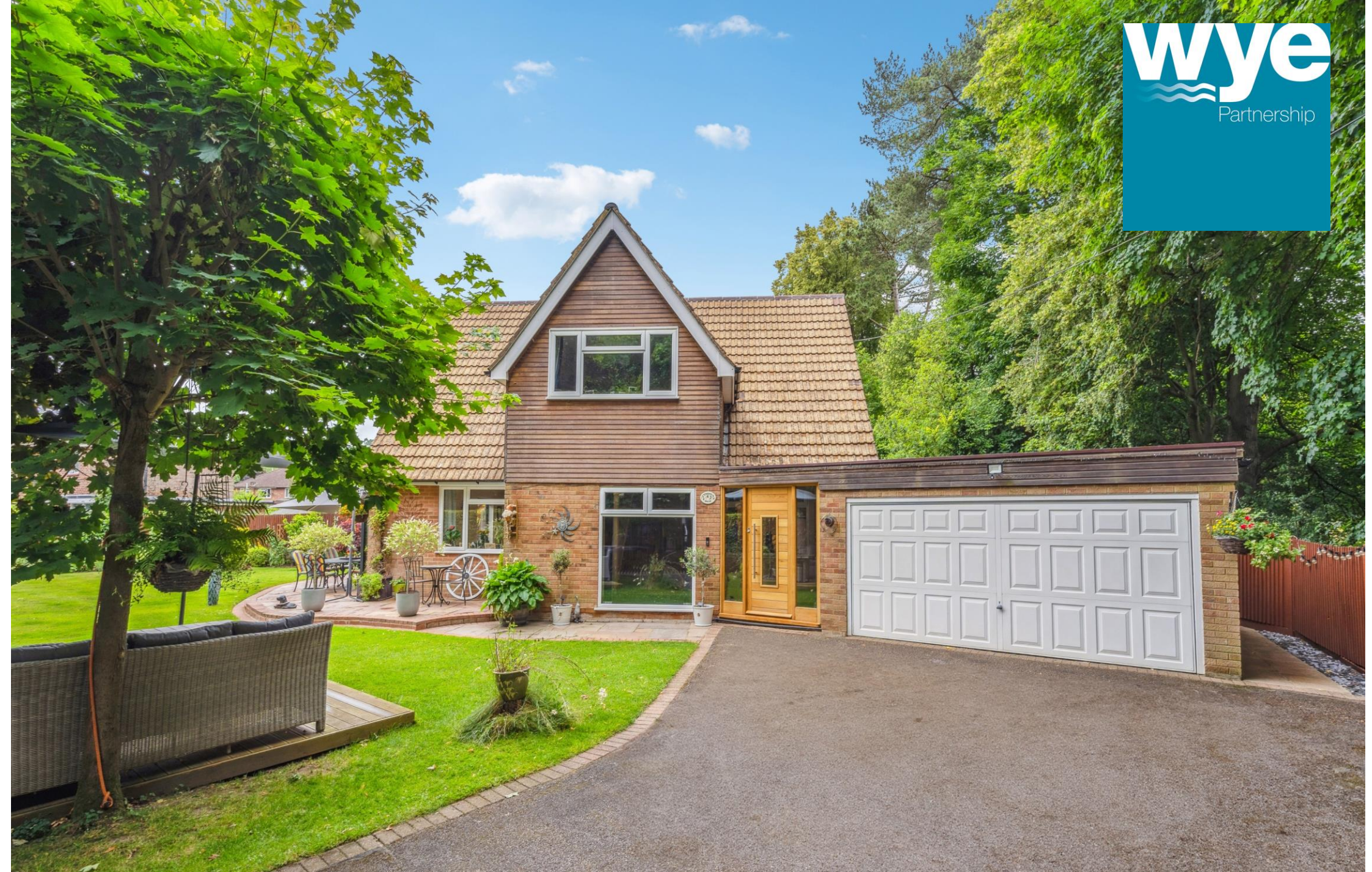
Narita, Hughenden Valley, Buckinghamshire, HP14 4LQ