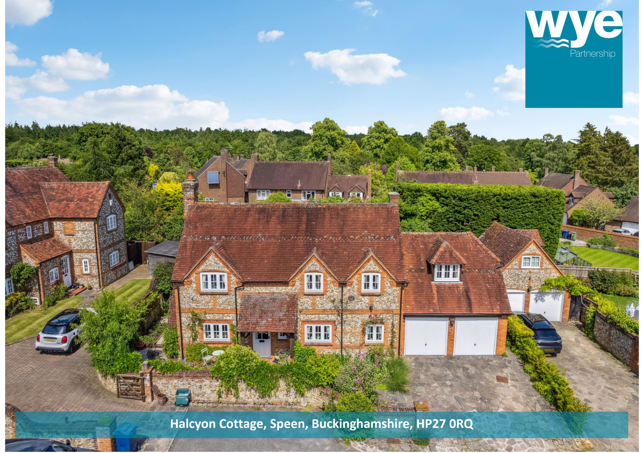
Halcyon Cottage, Speen, Buckinghamshire, HP27 0RQ