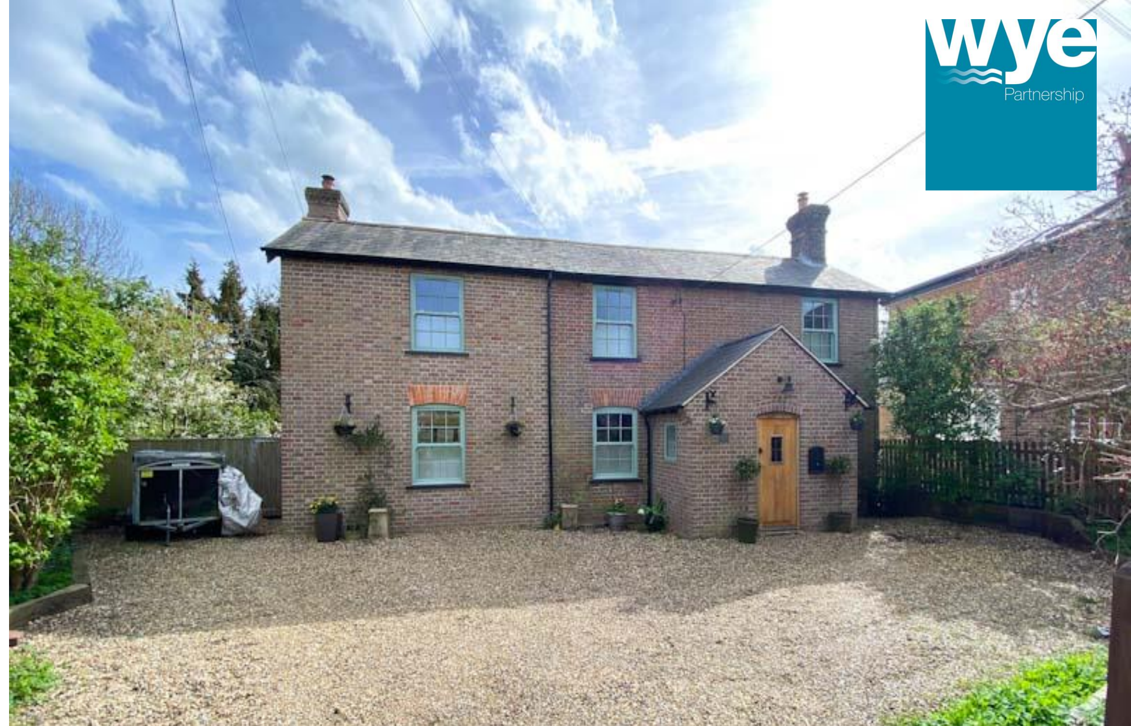
Forge Cottage, 89 High Street, Prestwood, Buckinghamshire, HP16 9ER