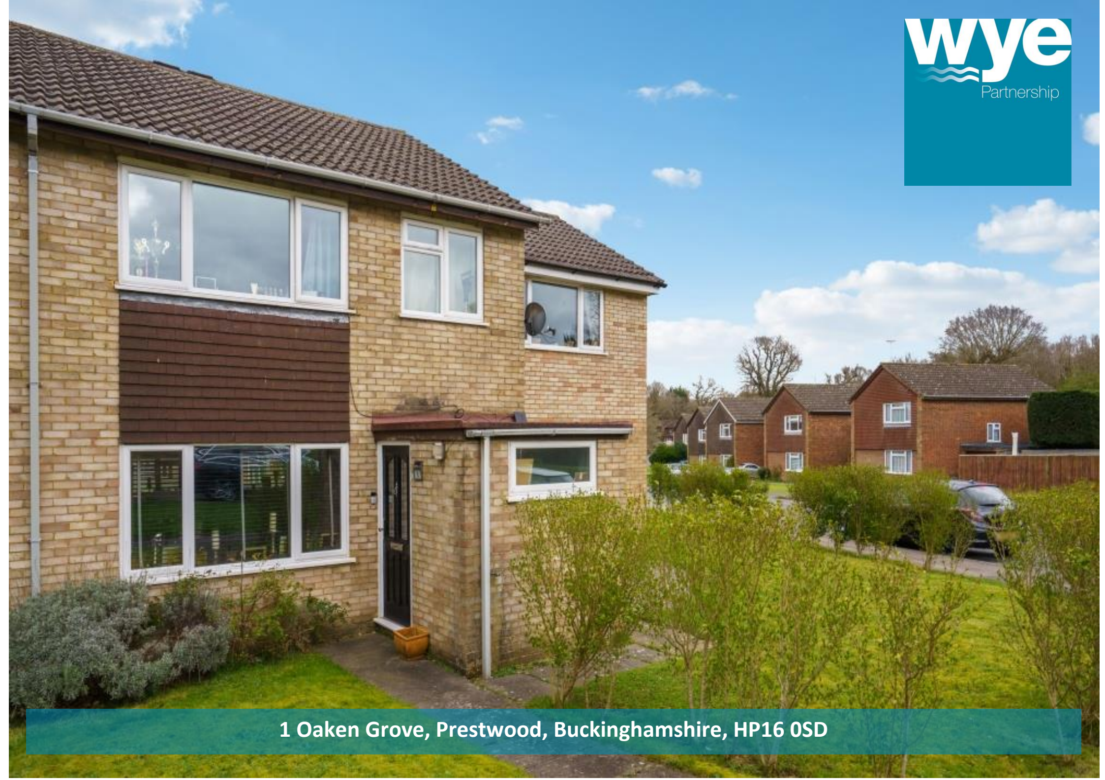
1 Oaken Grove, Prestwood, Buckinghamshire, HP16 0SD