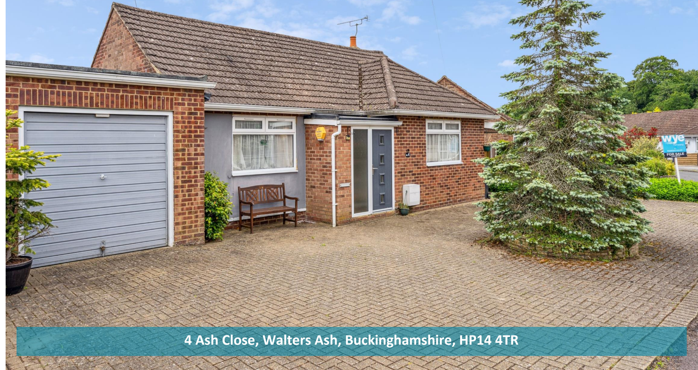
4 Ash Close, Walters Ash, Buckinghamshire, HP14 4TR