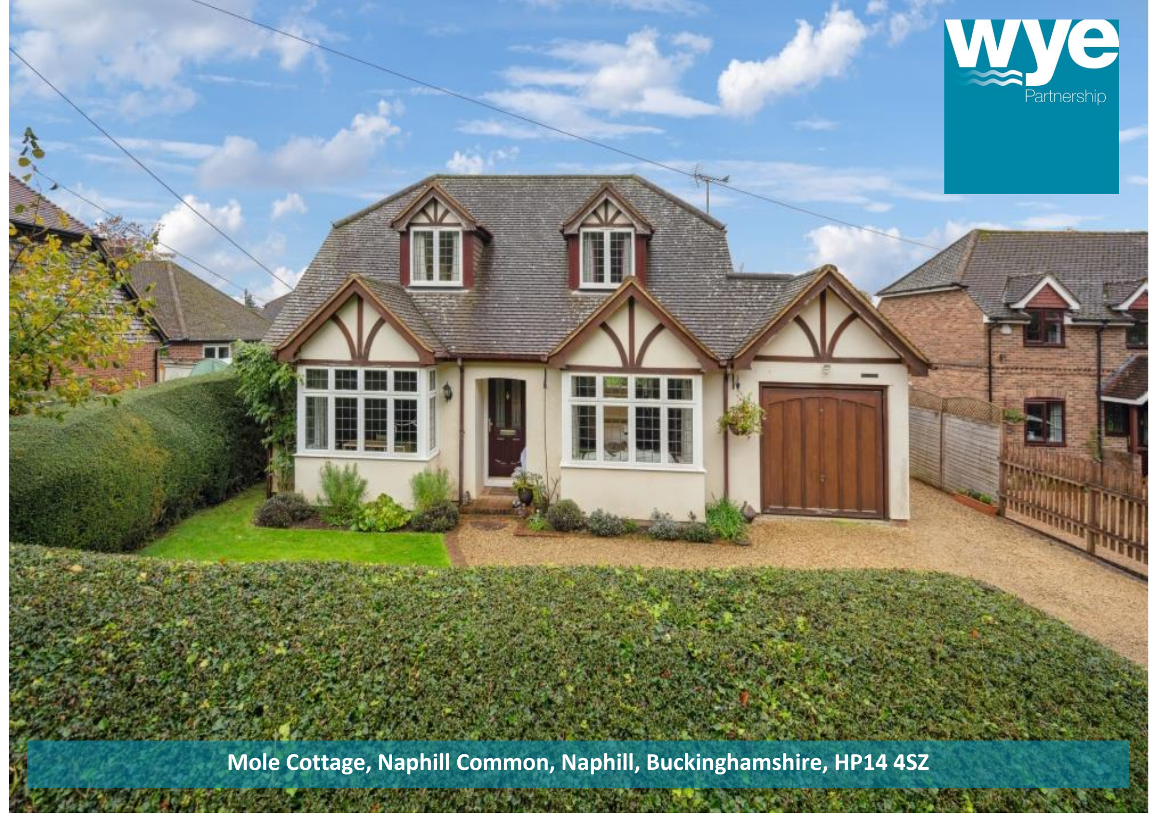
Mole Cottage, Naphill Common, Naphill, Buckinghamshire, HP14 4SZ