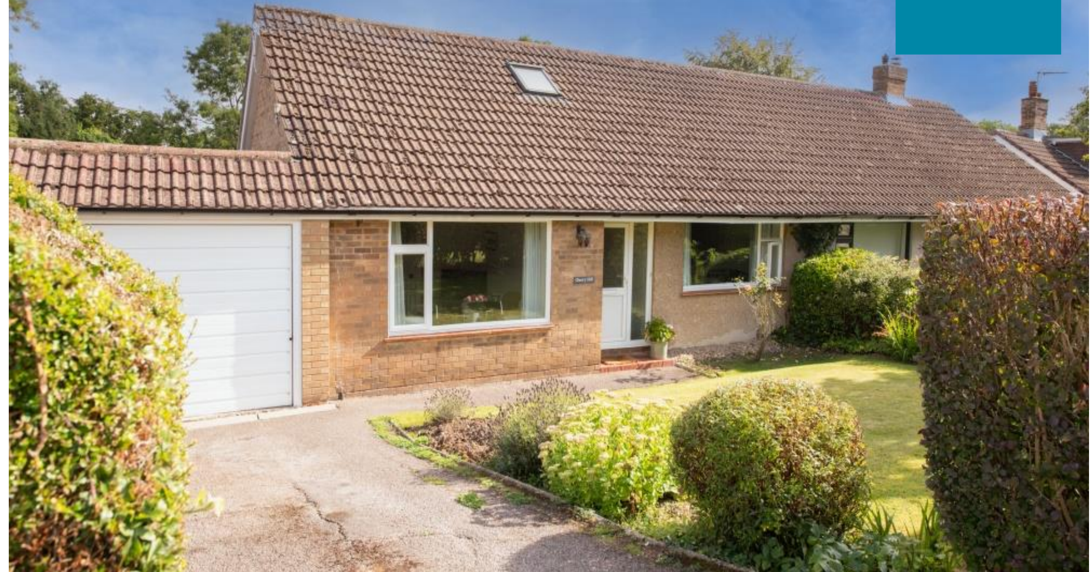
Cherry Hill, Chiltern Road, Ballinger, Buckinghamshire, HP16 9LH