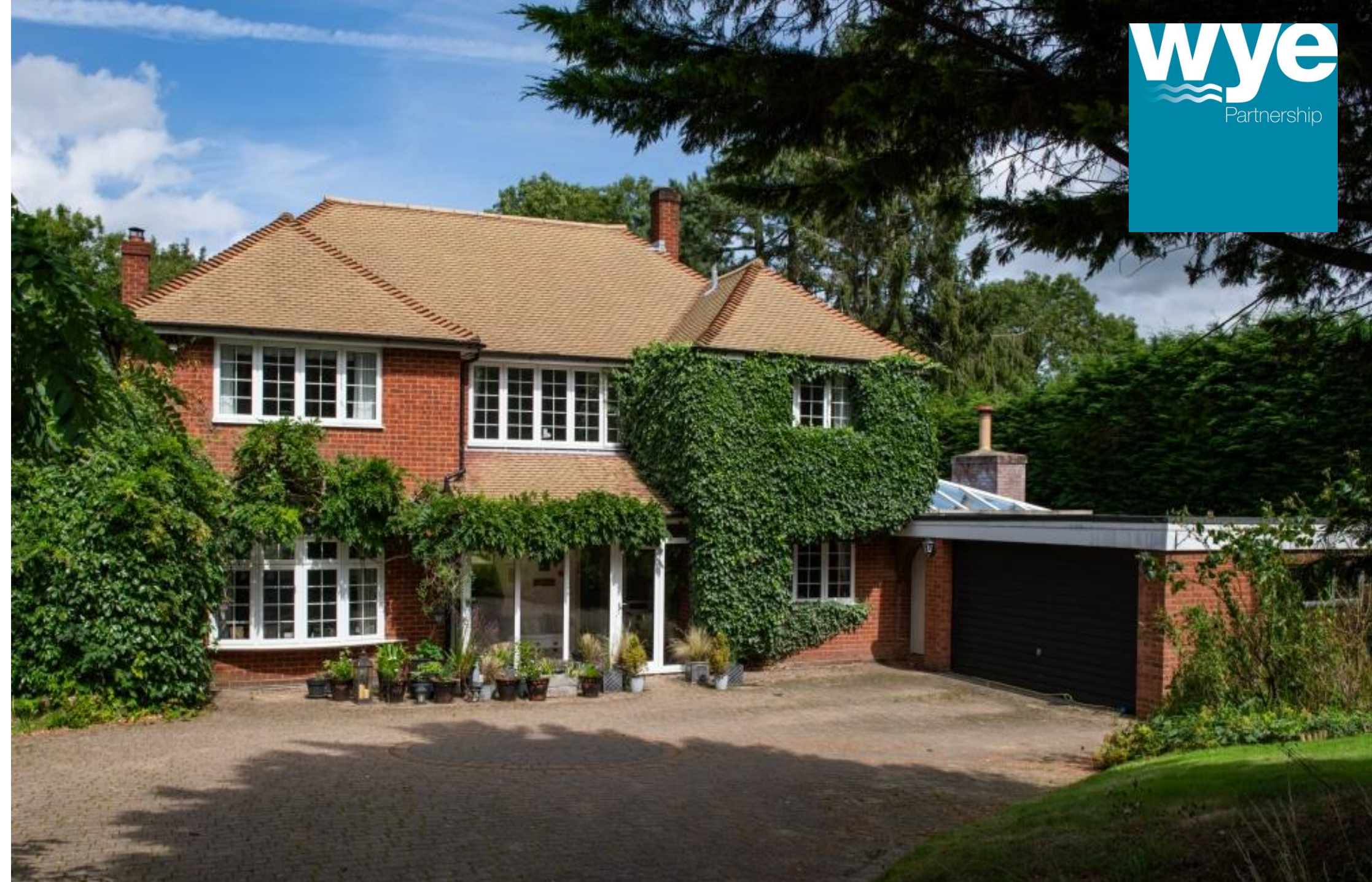
Woodland House, Great Missenden, Buckinghamshire, HP16 9LJ