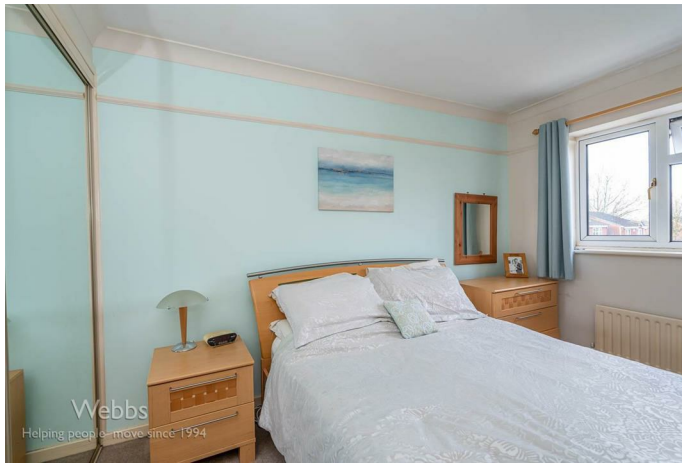
Webbs Helping people move since 1994