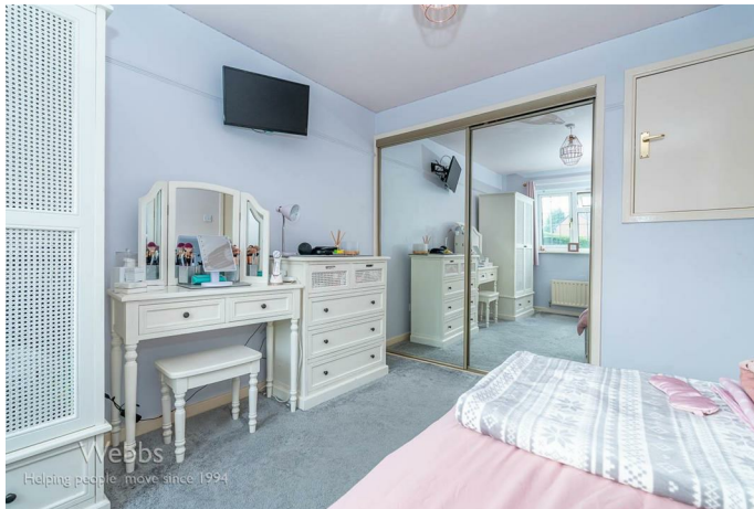
Webbs Helping people move since 1994