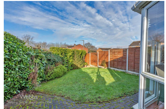
Webbs Helping people move since 1994