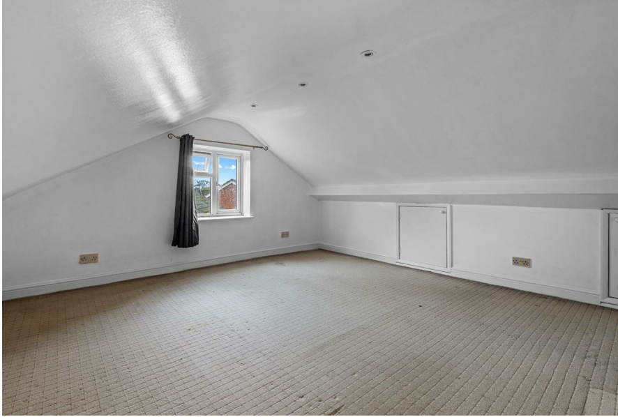
annex living room