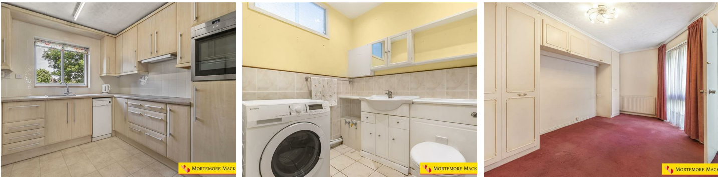
Approximate Gross Internal Area 1004 sq ft - 93 sq m