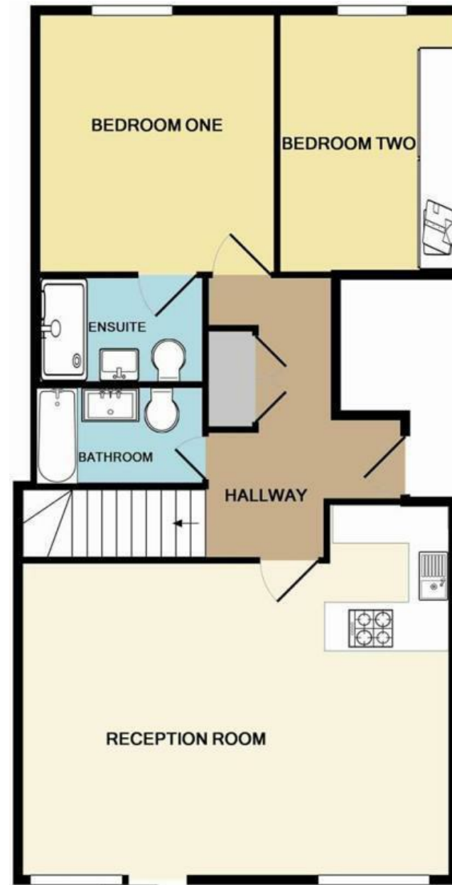
GROUND FLOOR APPROX. FLOOR AREA 79.3 SQ.M. (853 SQ.FT.)