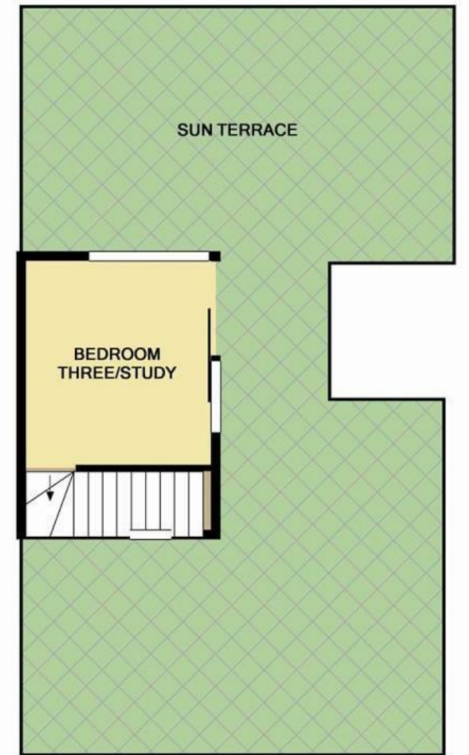
1ST FLOOR APPROX. FLOOR AREA 12.9 SQ.M. (139 SQ.FT.)